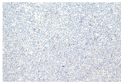
Immunohistochemical analysis of paraffinembedded human liver cancer tissue slide using KHC0007 (CD206 IHC Kit).