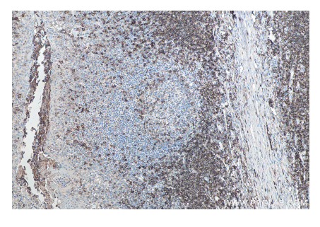
Immunohistochemical analysis of paraffinembedded human appendicitis tissue slide using KHC0015 (CD43 IHC Kit).