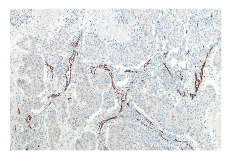
Immunohistochemical analysis of paraffinembedded human breast cancer tissue slide using KHC0023 (CD34 IHC Kit).