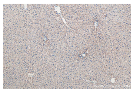
Immunohistochemical analysis of paraffinembedded rat liver tissue slide using KHC0041 (CK8 IHC Kit).

Immunohistochemical analysis of paraffinembedded human liver tissue slide using KHC0041 (CK8 IHC Kit).