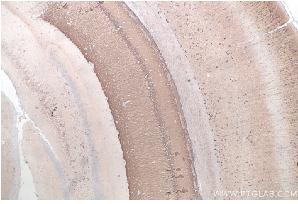
Immunohistochemical analysis of paraffin-embedded rat brain tissue slide using KHC0048 (WFS1 IHC Kit).