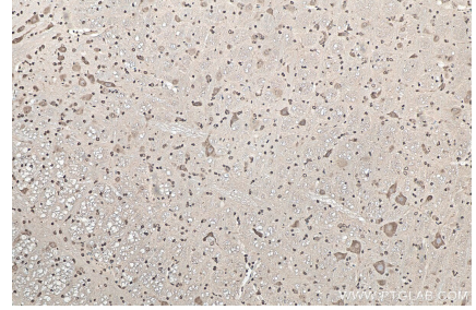
Immunohistochemical analysis of paraffinembedded rat cerebellum tissue slide using KHC0052 (SOD1 IHC Kit).