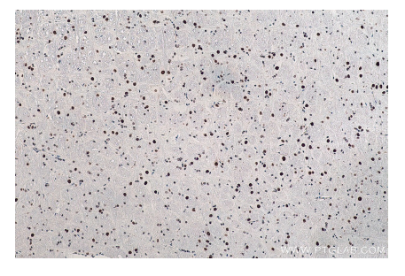
Immunohistochemical analysis of paraffinembedded rat cerebellum tissue slide using KHC0055 (DACH1 IHC Kit).