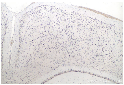
Immunohistochemical analysis of paraffinembedded rat brain tissue slide using KHC0055 (DACH1 IHC Kit).