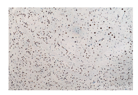
Immunohistochemical analysis of paraffinembedded mouse cerebellum tissue slide using KHC0055 (DACH1 IHC Kit).