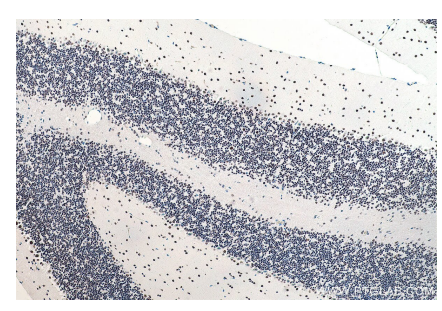
Immunohistochemical analysis of paraffinembedded mouse cerebellum tissue slide using KHC0055 (DACH1 IHC Kit).