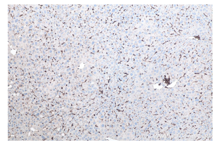
Immunohistochemical analysis of paraffinembedded mouse liver tissue slide using KHC0060 (STING IHC Kit).