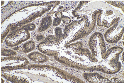
Immunohistochemical analysis of paraffinembedded human colon cancer tissue slide using KHC0145 (METTL14 IHC Kit).