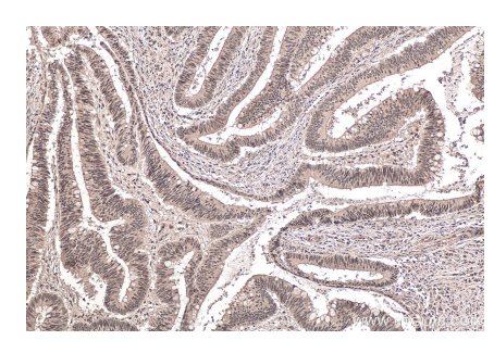
Immunohistochemical analysis of paraffinembedded human colon cancer tissue slide using KHC0151 (RBM15B IHC Kit).