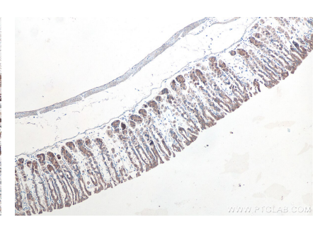
Immunohistochemical analysis of paraffinembedded mouse stomach tissue slide using KHC0161 (IGF2BP2 IHC Kit).