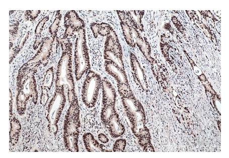
Immunohistochemical analysis of paraffinembedded human colon cancer tissue slide using KHC0172 (NSUN2 IHC Kit).