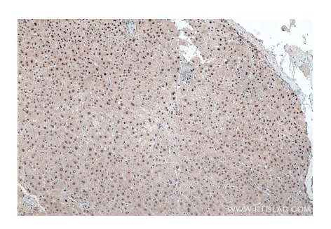
Immunohistochemical analysis of paraffinembedded human liver tissue slide using KHC0172 (NSUN2 IHC Kit).