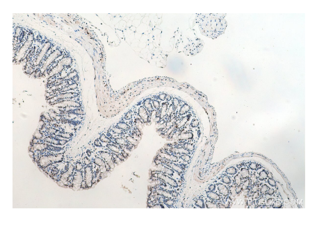
Immunohistochemical analysis of paraffinembedded mouse colon tissue slide using KHC0175 (ALY IHC Kit).