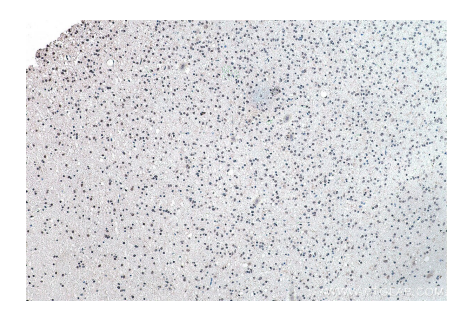
Immunohistochemical analysis of paraffinembedded human gliomas tissue slide using KHC0175 (ALY IHC Kit).