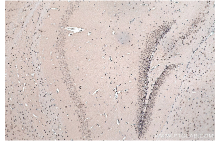
Immunohistochemical analysis of paraffin-embedded mouse brain tissue slide using KHC0182 (FBL IHC Kit).