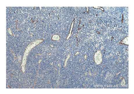
Immunohistochemical analysis of paraffinembedded human tonsillitis tissue slide using KHC0191 (PLVAP IHC Kit).