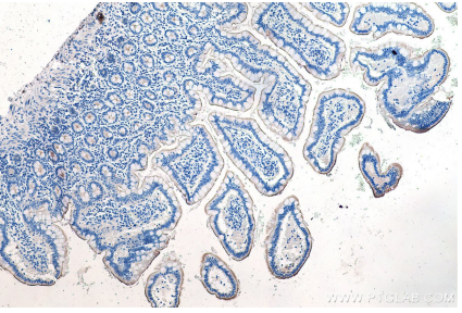
Immunohistochemical analysis of paraffinembedded human kidney tissue slide using KHC0194 (SLC13A2 IHC Kit).