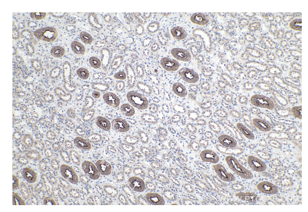
Immunohistochemical analysis of paraffinembedded human kidney tissue slide using KHC0198 (AQP2 IHC Kit).