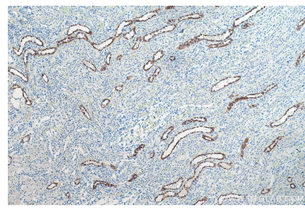
Immunohistochemical analysis of paraffinembedded rat kidney tissue slide using KHC0198 (AQP2 IHC Kit).