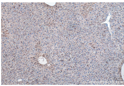
Immunohistochemical analysis of paraffinembedded mouse liver tissue slide using KHC0208 (F4/80 IHC Kit).