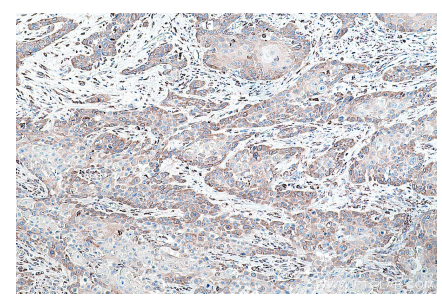
Immunohistochemical analysis of paraffinembedded human oesophagus cancer tissue slide using KHC0222 (LRPAP1 IHC Kit).