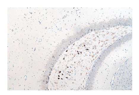
Immunohistochemical analysis of paraffinembedded mouse brain tissue slide using KHC0222 (LRPAP1 IHC Kit).