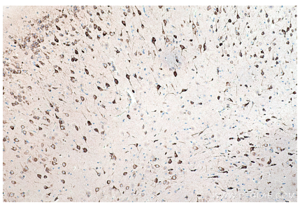
Immunohistochemical analysis of paraffinembedded rat brain tissue slide using KHC0222 (LRPAP1 IHC Kit).