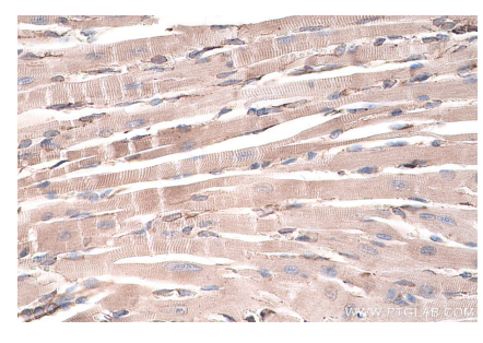
Immunohistochemical analysis of paraffinembedded mouse heart tissue slide using KHC0236 (GPD2 IHC Kit).