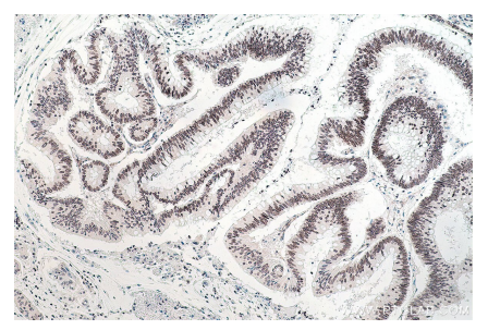
Immunohistochemical analysis of paraffinembedded human colon cancer tissue slide using KHC0296 (BMI1 IHC Kit).