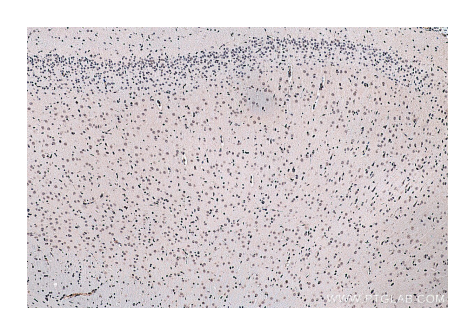
Immunohistochemical analysis of paraffinembedded rat brain tissue slide using KHC0296 (BMI1 IHC Kit).