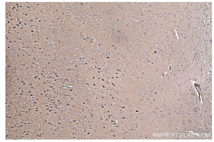
Immunohistochemical analysis of paraffinembedded mouse brain tissue slide using KHC0297 (PCDHA3 IHC Kit).