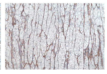
Immunohistochemical analysis of paraffinembedded human liver cancer tissue slide using KHC0314 (COL6A1 IHC Kit).