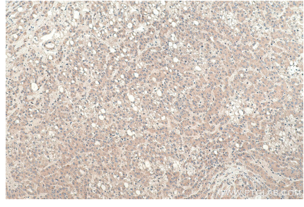
Immunohistochemical analysis of paraffinembedded human liver cancer tissue slide using KHC0377 (TF IHC Kit).