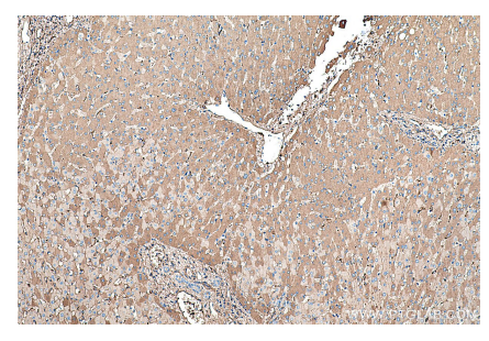
Immunohistochemical analysis of paraffinembedded human liver tissue slide using KHC0381 (APOA2 IHC Kit).