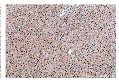
Immunohistochemical analysis of paraffinembedded rat liver tissue slide using KHC0383 (ARG1 IHC Kit).