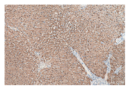
Immunohistochemical analysis of paraffinembedded human liver tissue slide using KHC0383 (ARG1 IHC Kit).