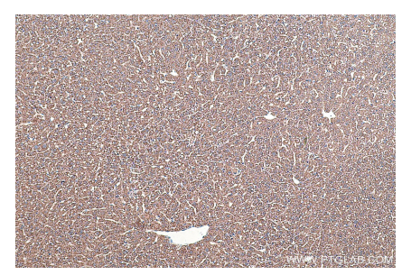
Immunohistochemical analysis of paraffinembedded mouse liver tissue slide using KHC0393 (ACSL1 IHC Kit).