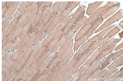
Immunohistochemical analysis of paraffinembedded rat skeletal muscle tissue slide using KHC0393 (ACSL1 IHC Kit).