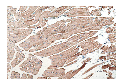
Immunohistochemical analysis of paraffinembedded mouse skeletal muscle tissue slide using KHC0393 (ACSL1 IHC Kit).