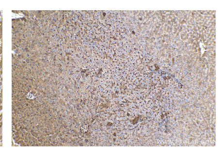
Immunohistochemical analysis of paraffinembedded rat liver tissue slide using KHC0397 (CRP IHC Kit).