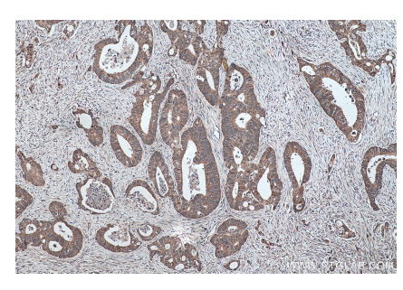
Immunohistochemical analysis of paraffinembedded human colon cancer tissue slide using KHC0411 (Carboxypeptidase B2 IHC Kir)