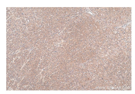
Immunohistochemical analysis of paraffinembedded human liver cancer tissue slide using KHC0412 (CPNE8 IHC Kit).