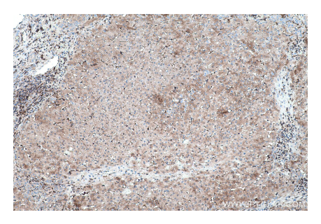
Immunohistochemical analysis of paraffinembedded human liver cancer tissue slide using KHC0421 (GBP1 IHC Kit).