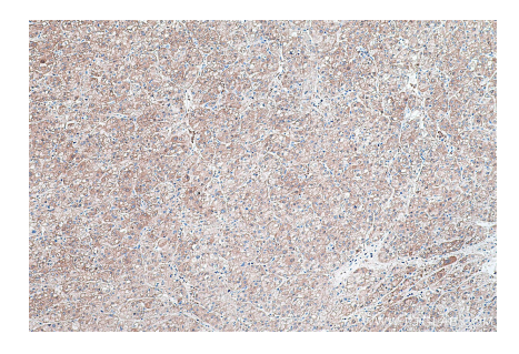
Immunohistochemical analysis of paraffinembedded human liver tissue slide using KHC0426 (HPRT1 IHC Kit).

Immunohistochemical analysis of paraffinembedded human liver cancer tissue slide using KHC0426 (HPRT1 IHC Kit).