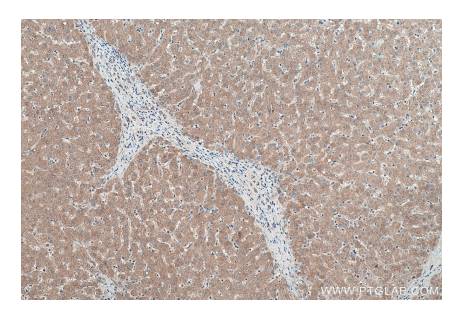
Immunohistochemical analysis of paraffinembedded human liver tissue slide using KHC0442 (NME1 IHC Kit).