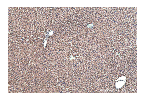
Immunohistochemical analysis of paraffinembedded rat liver tissue slide using KHC0442 (NME1 IHC Kit).