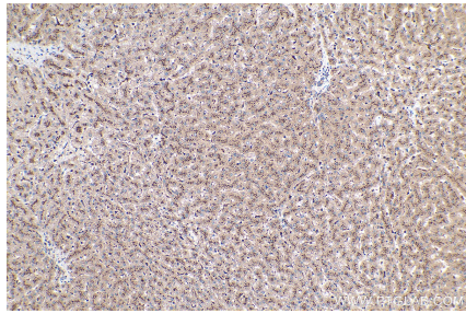
Immunohistochemical analysis of paraffinembedded human liver tissue slide using KHC0457 (SDSL IHC Kit).