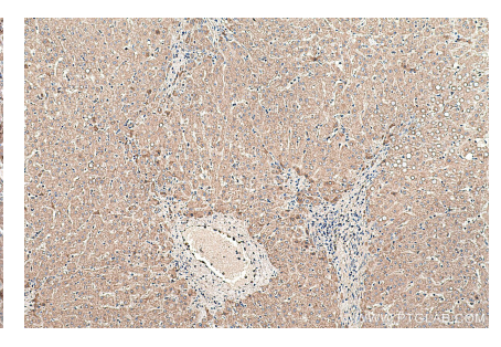
Immunohistochemical analysis of paraffinembedded human liver tissue slide using KHC0462 (SERPINF1/PEDF IHC Kit).