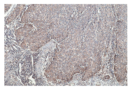
Immunohistochemical analysis of paraffinembedded human cervical cancer tissue slide using KHC0462 (SERPINF1/PEDF IHC Kit).