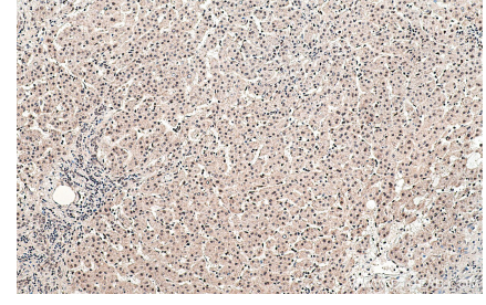
Immunohistochemical analysis of paraffinembedded human liver cancer tissue slide using KHC0463 (SF3B5 IHC Kit).

Immunohistochemical analysis of paraffinembedded human ovary tumor tissue slide using KHC0463 (SF3B5 IHC Kit).