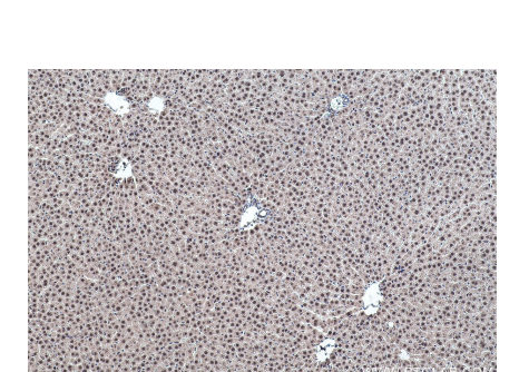
Immunohistochemical analysis of paraffinembedded rat liver tissue slide using KHC0463 (SF3B5 IHC Kit).