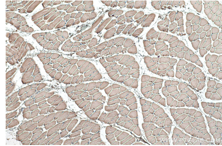
Immunohistochemical analysis of paraffinembedded mouse skeletal muscle tissue slide using KHC0488 (ALDOA IHC Kit).