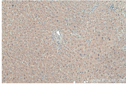
Immunohistochemical analysis of paraffinembedded human liver tissue slide using KHCO488 (ALDOA IHC Kit).