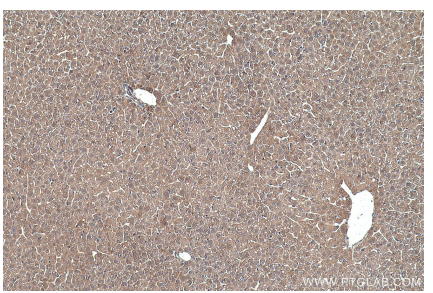
Immunohistochemical analysis of paraffinembedded mouse liver tissue slide using KHC0488 (ALDOA IHC Kit).