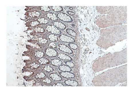
Immunohistochemical analysis of paraffinembedded human colon tissue slide using KHCO488 (ALDOA IHC Kit).