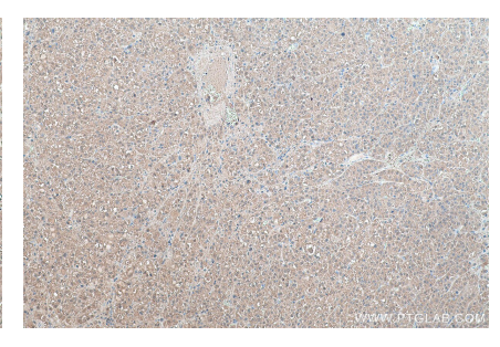
Immunohistochemical analysis of paraffinembedded human liver cancer tissue slide using KHC0488 (ALDOA IHC Kit).