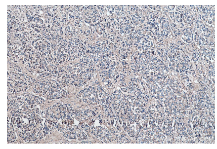
Immunohistochemical analysis of paraffinembedded human colon cancer tissue slide using KHC0490 (AGT IHC Kit).