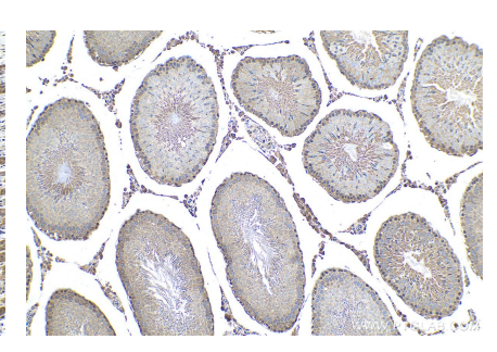
Immunohistochemical analysis of paraffinembedded rat testis tissue slide using KHC0500 (PEBP1 IHC Kit).