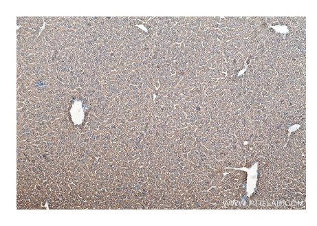
Immunohistochemical analysis of paraffinembedded mouse liver tissue slide using KHC0502 (ACAA2 IHC Kit).