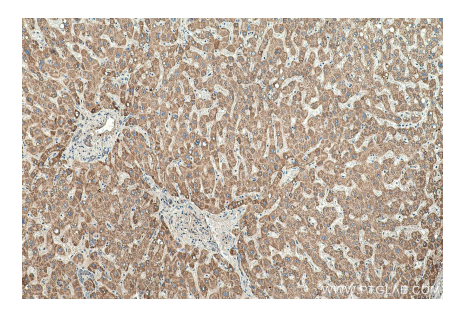
Immunohistochemical analysis of paraffinembedded human liver tissue slide using KHC0502 (ACAA2 IHC Kit).