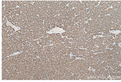
Immunohistochemical analysis of paraffinembedded human liver cancer tissue slide using KHC0502 (ACAA2 IHC Kit).