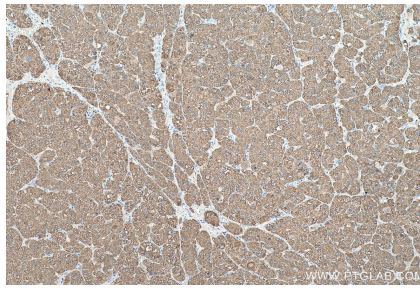
Immunohistochemical analysis of paraffinembedded human liver cancer tissue slide using KHC0503 (CES1 IHC Kit).