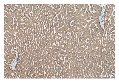
Immunohistochemical analysis of paraffinembedded human liver tissue slide using KHC0503 (CES1 IHC Kit).