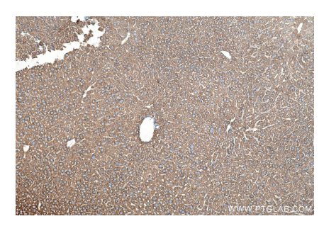
Immunohistochemical analysis of paraffinembedded mouse liver tissue slide using KHC0504 (ACAT1 IHC Kit).