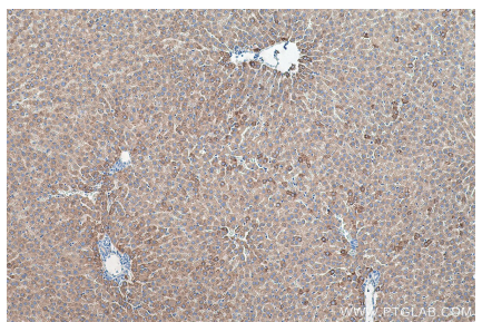
Immunohistochemical analysis of paraffinembedded rat liver tissue slide using KHC0504 (ACAT1 IHC Kit).