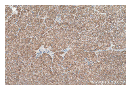
Immunohistochemical analysis of paraffinembedded human liver cancer tissue slide using KHC0504 (ACAT1 IHC Kit).