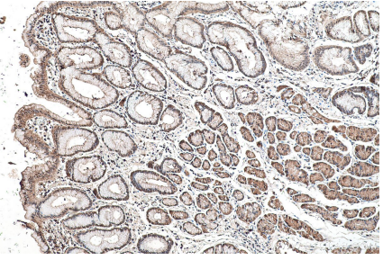
Immunohistochemical analysis of paraffinembedded human liver tissue slide using KHC0513 (PRDX6 IHC Kit).