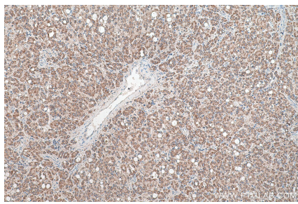
Immunohistochemical analysis of paraffinembedded human liver cancer tissue slide using KHC0570 (PHB2 IHC Kit).