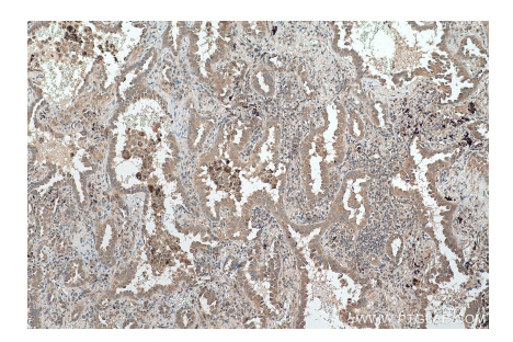
Immunohistochemical analysis of paraffinembedded human lung cancer tissue slide using KHC0573 (HSD17B4 IHC Kit).