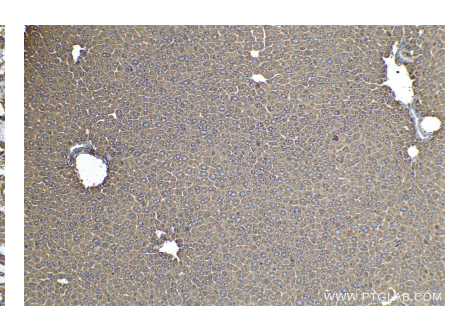
Immunohistochemical analysis of paraffinembedded mouse liver tissue slide using KHC0579 (PDIA6 IHC Kit).