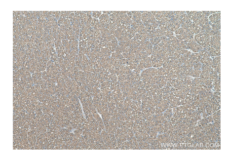
Immunohistochemical analysis of paraffinembedded human liver cancer tissue slide using KHC0579 (PDIA6 IHC Kit).