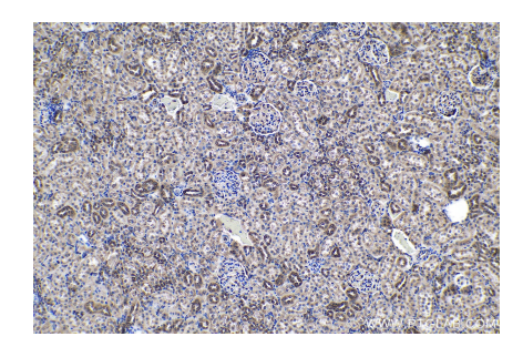
Immunohistochemical analysis of paraffinembedded rat kidney tissue slide using KHC0579 (PDIA6 IHC Kit).