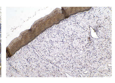
Immunohistochemical analysis of paraffinembedded human cervical cancer tissue slide using KHC0756 (KRT81 IHC Kit).