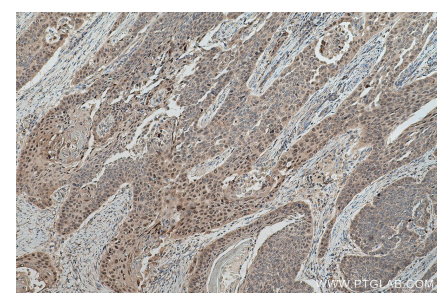
Immunohistochemical analysis of paraffinembedded human oesophagus cancer tissue slide using KHC0759 (MCC IHC Kit).