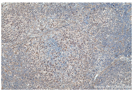
Immunohistochemical analysis of paraffinembedded human lymphoma tissue slide using KHC0759 (MCC IHC Kit).