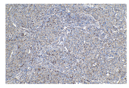
Immunohistochemical analysis of paraffinembedded human lung cancer tissue slide using KHC1132 (GRN IHC Kit).