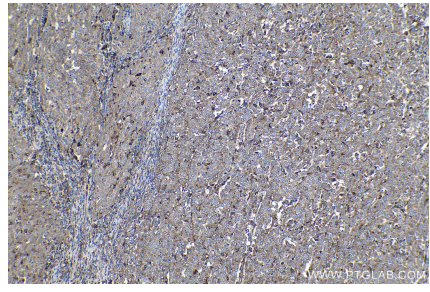
Immunohistochemical analysis of paraffinembedded human ovary tumor tissue slide using KHC1132 (GRN IHC Kit).