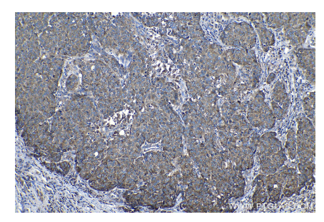
Immunohistochemical analysis of paraffinembedded human stomach cancer tissue slide using KHC1132 (GRN IHC Kit).